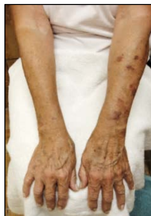
After 20 Minutes

To read more about MicroSilk®, visit www.microsilkbath.com